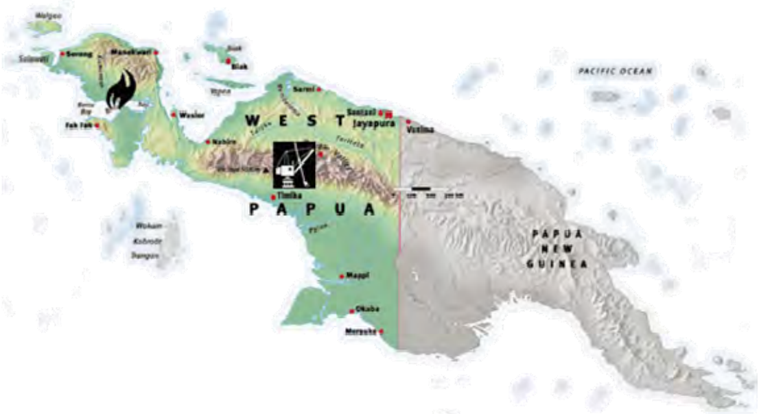
Click above to enlarge the map

West Papua combined with Papua New Guinea comprise the second largest island in the world after Greenland.